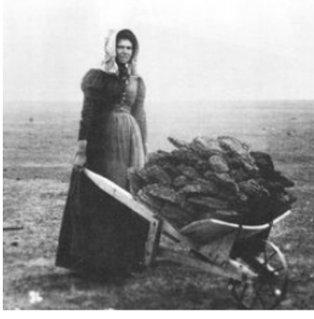
Pioneer woman collecting buffalo chips

Life in Haneyville. Left: Typical sod hut. Right: Photo taken in the same general area a decade or so earlier. Both photos show what life was like on cold and treeless prairies.